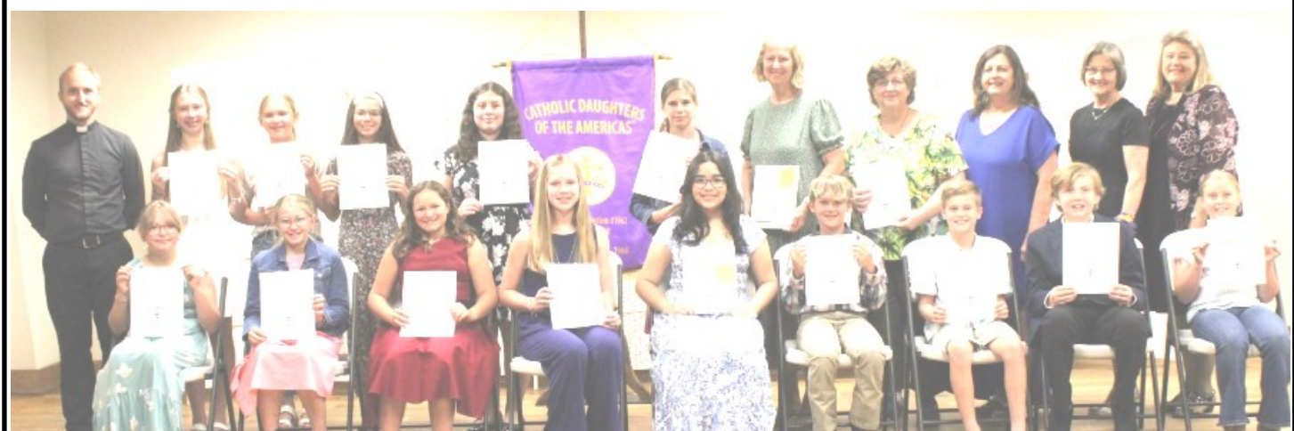
Pictured Above: Court Annunciation #1962 Education Contest Winners