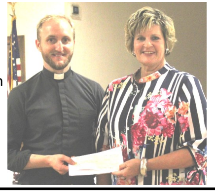
Pictured Right: $500 Sacred Heart Catholic School Library Donation

Pictured Left: Five new members, two-50 year and six-25-year membership pins presented, and the four Charter Members recognized.