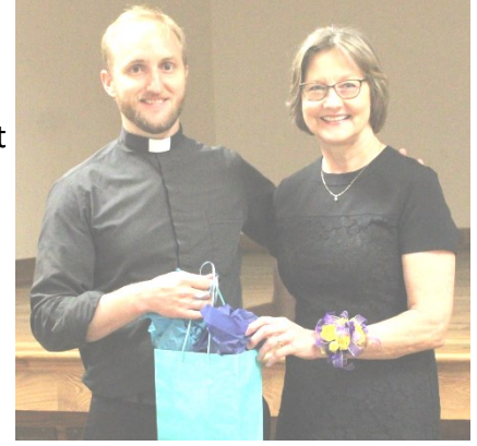
Pictured Right: National CDA Priest Appreciation Day gift